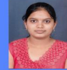
Miss. Pratibha Patil (71.66%)